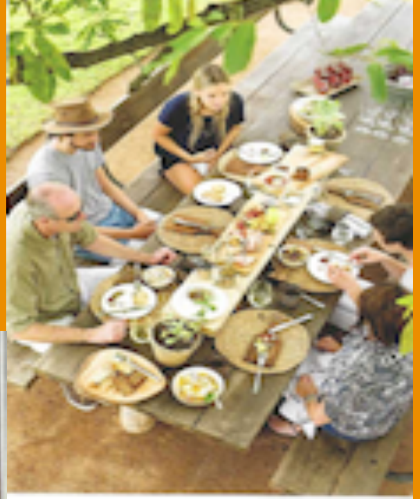
<<<< Balloon breakfast in the Bush!!!